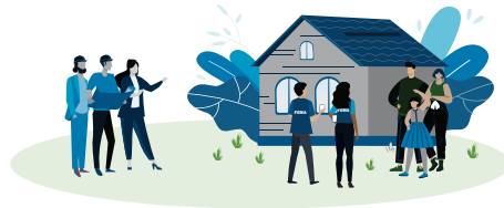
Repairing uninsured or underinsured homes