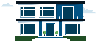
Renting temporary housing